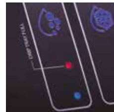
Drip tray full alert

Essential and elegant, feeling at home in every type of environment. Intelligent in its design, to offer the required internal space for the desired filtration. Efficient in its performance and simple in its functionality, to dispense 3 different types of water. HYDRAZON is the perfect solution for any office or workplace.